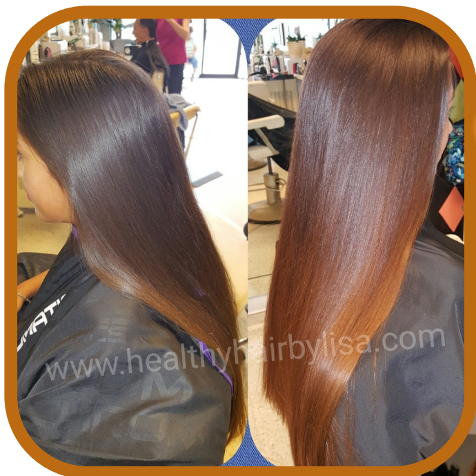
Golden Brown Sombre

If being any shade of red or copper is not for you, there are other options that are also fashionable. Buttery, Natural Blondes are in style. Deep Chocolate Brunettes and Bronde (mixture of brown and blonde) are the fashion.