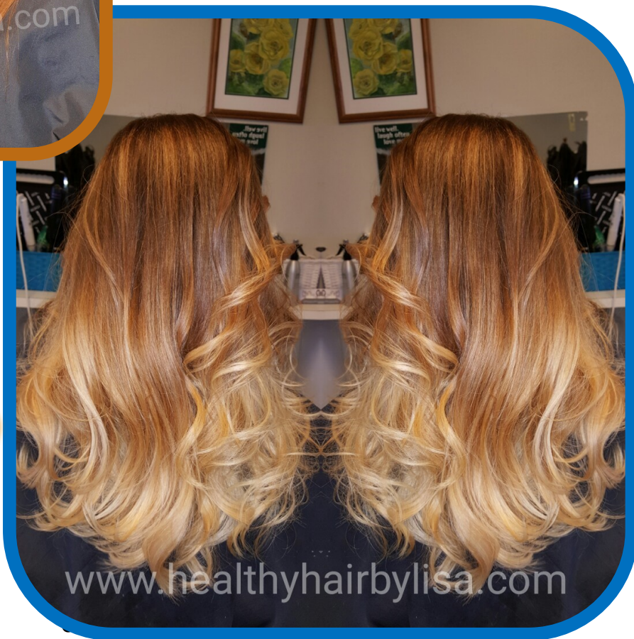
Medium Brown to Light Blonde Ombre